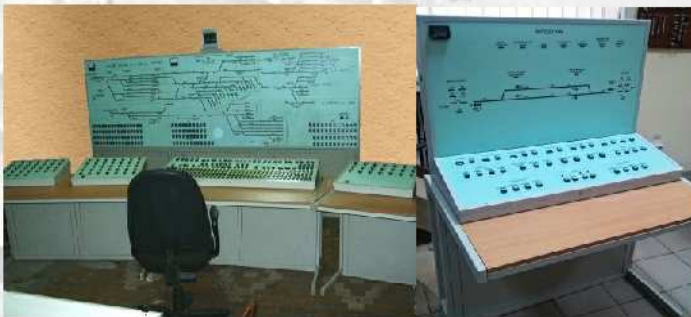
Control and monitoring equipment