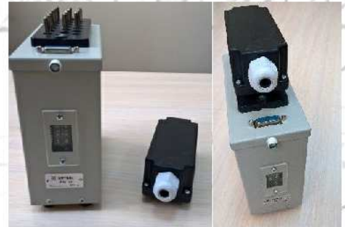
Pulse sensors, transmitters